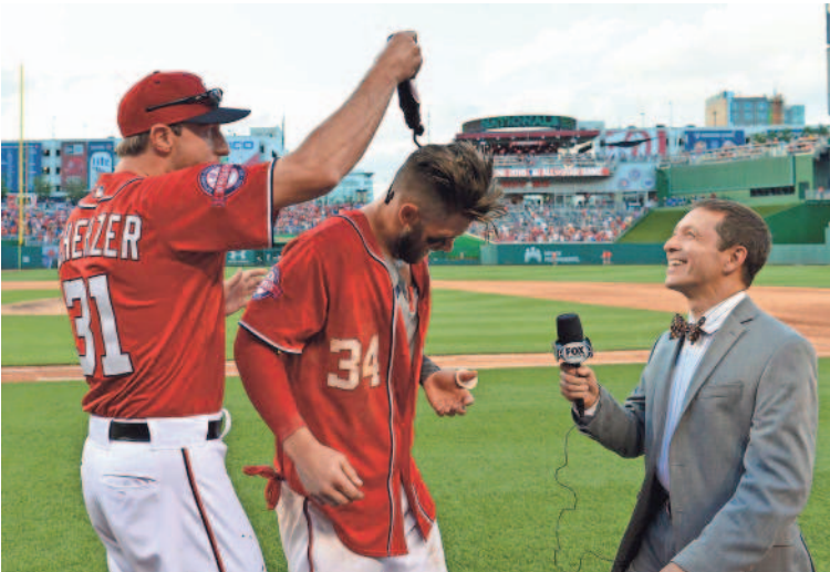
Ken Rosenthal interviews Bryce Harper as Max Scherzer pours chocolate syrup on the outfielder.

The New York Post, which first reported Rosenthal’s departure, said Rosenthal was removed from MLB Network for roughly two months in the summer of 2020, a de facto suspension that came on the heels of Rosenthal’s pointed