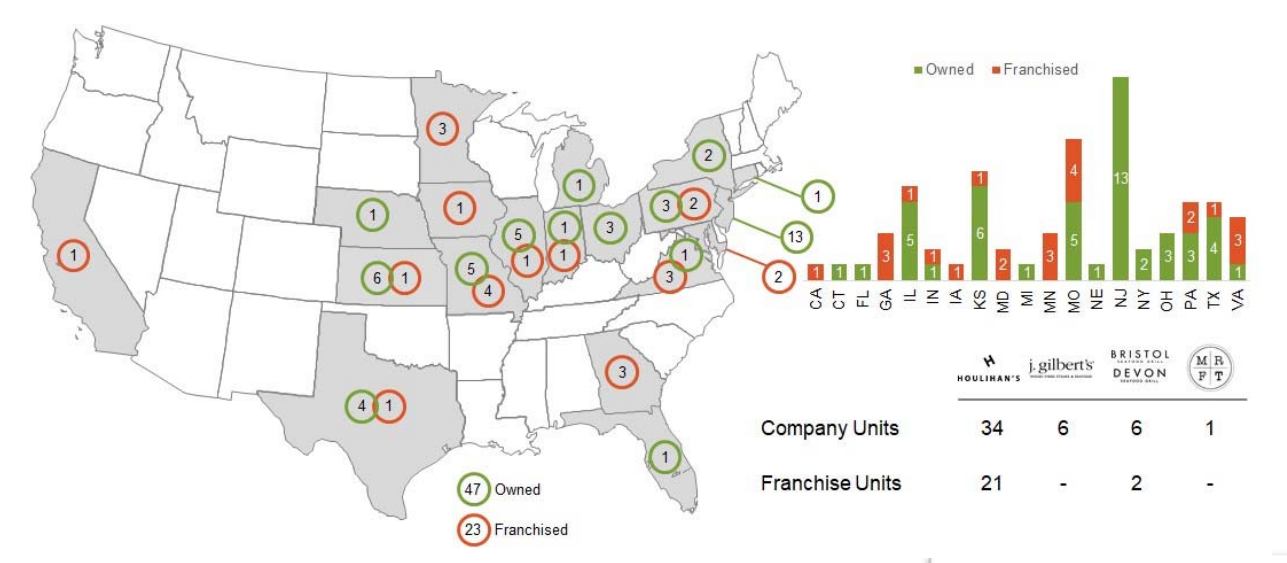
Case 19-12415 Doc 2 Filed 11/14/19 Page 3 of 15

6. The Company's thirty-four (34) Houlihan's Restaurant + Bar (a/k/a Houlihan's) restaurants are leaders in the "polished casual" dining space, offering a unique, made from scratch menu and energetic bar scene; its six (6) J. Gilbert's Wood-Fired Steak + Seafood (a/k/a J. Gilbert's) restaurants offer a modern twist on the classic American steakhouse, crafting high-quality, wood-fired steaks in an upscale yet rustic and warm environment; its six (6) seafood restaurants (three (3) Bristol Seafood Grill ("<u>Bristol</u>") and three (3) Devon Seafood Grill ("<u>Devon</u>"))