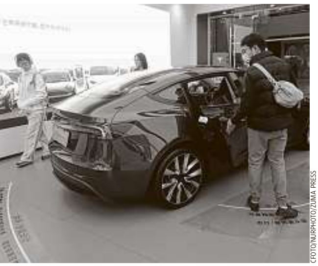
Tesla shipped 60,365 China-made vehicles during the month.

Tesla has said the plant now has reached a volume of about 6,000 cars a week.